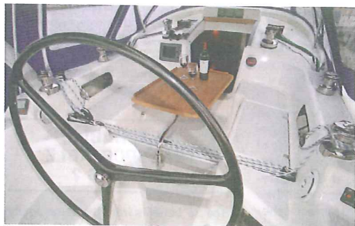
The Danish "loggia", to be taken without moderation !

moderate 7 to 12 knots to accompany us, and I got to know the toys that I would be able to play with to my heart's content over the two days. Firstly, the Kevlar rigging, which can be tightened up very quickly, then the 'fine lingerie' - this 'Ultimate' version is equipped with flamboyant 'Genesis' black Technora' sails by Elvström. Vectran, Carbon and Mylar combine their qualities in this top-of-the-range laminate, the shape is splendid, the enormous stability requires no