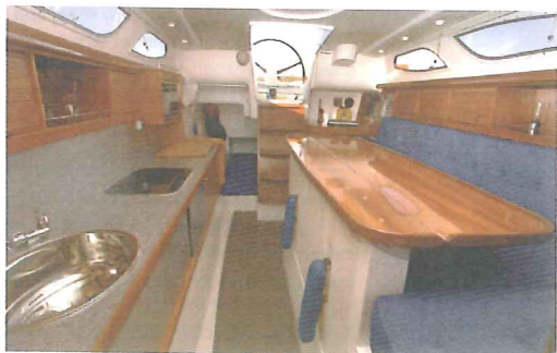
A surprising volume : 4 people for an Atlantic crossing, 6 for a weekend or 8 for an afternoon.