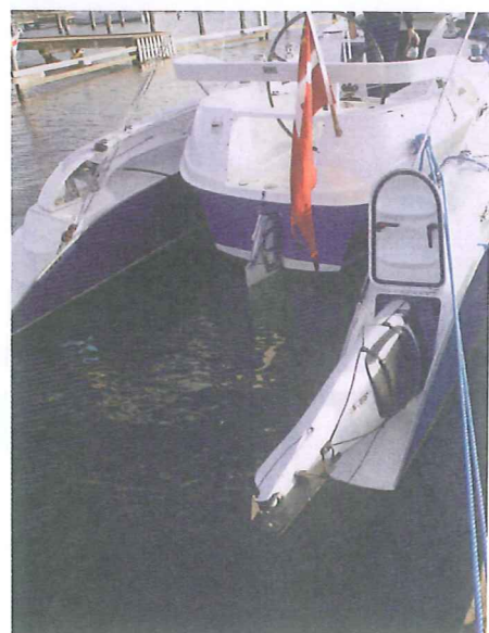
One or two kayaks, a small catamaran which can be dismantled... The volume in the floats acts as a spacious luggage carrier...