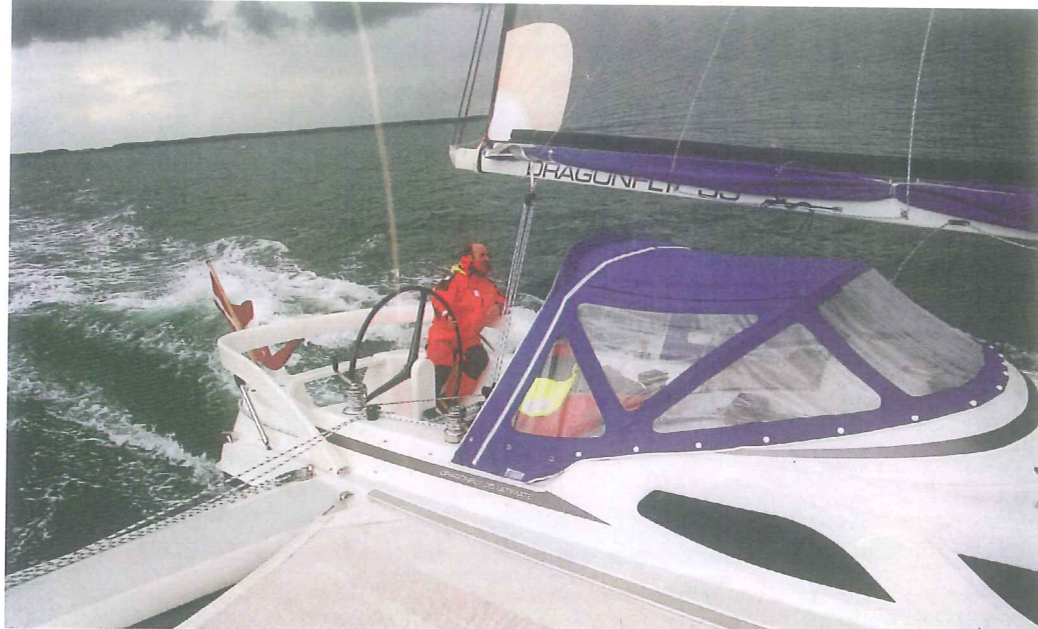
Low, heavy clouds, squall approaching, the DF35' accelerates...with fingertip control.

increased tension and puts off the moment when a reef must be taken.