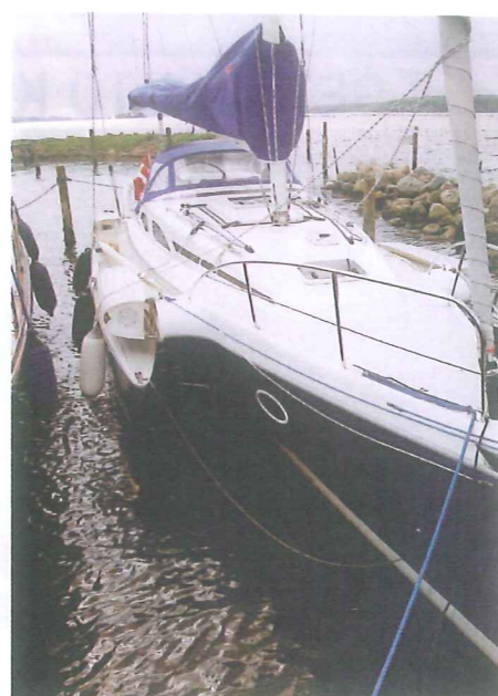
The "mouse hole" type of marina the Dragonfly loves.

This trimaran is exciting; the maturity of the comfort-performance compromise it synthesises is remarkable, it is without a doubt one of the most successful cruising boats I have ever been given to test. The Touring version is a bit more sensible and cheaper, but the Ultimate opens the gates to Valhalla permanently!