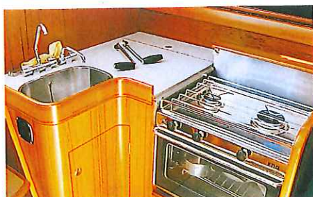
The well-designed galley is very pleasant.

CE Categories (CE94/25): Category A for 8 people