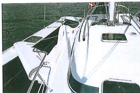
It takes precisely 32 seconds to fold or unfold each beam.