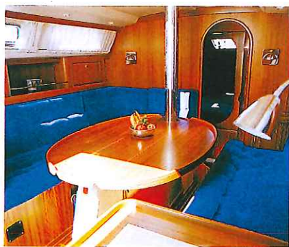
The table in the saloon can hold 6 people.

What a beautiful lesson in wisdom from this maker! Although the shipyard is small, a closer look, through its past, the number of boats built and sailing all over the world makes it clear: this shipyard is more a great "master of sailing", one of those rare shipyards enamored of fine workmanship. In fact, it has put out over 300 Quorning trimarans. The latest born, with lines that are intentionally not overly futuristic, will remain discreet, even tiny, in a marina and a pleasure in its performances that far outshine a very good monohull, with her variable draft and major active safety features. All these advantages have a cost, as you can well imagine. This is no industrial mass production, but the use of the finest quality materials and accessories (17-m carbon mast profile). Comparisons would be deceptive, particularly since there is actually very little competition in this range of 12-m trimarans at present... and here, at Multihulls World, we can feel the wave rise, and keep on rising.