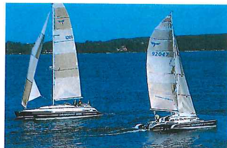
The 920 and 1200 share a family resemblance.

With all her sails hoisted, the Dragonfly 1200 showed her excellent balance at the helm. With the puffs of wind, the stability was maintained effortlessly. Without being fickle, the keel easily accepts accelerations without however lifting the windward float too high out of the water. It probably requires very much more for this offshore racer to taken on a dangerous posture. The feeling of the helm is gentle, almost too much so, inducing a certain lack of sensitivity more often experienced with larger units. On a tacking course, the Dragonfly 1200 disclosed an ability to come round equivalent or even superior to an excellent monohull. Tack on tack, the dead angle is 85°, which enabled us with a true wind of 18/20 knots to head 33° of apparent wind: very close to the limit! The advantage of this type of trimaran is obvious, demonstrating how much this ability to maintain heading upwind without losing too much speed is essential for an extended cruising agenda. During these stringent tacking trials, our dragonfly 1200