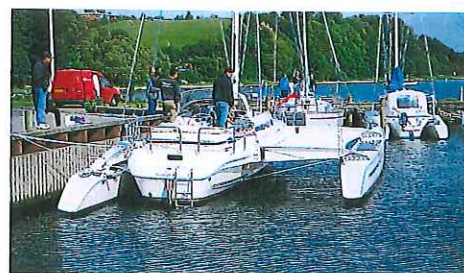
The ingenious retractable beam system enables the 1200 to be as comfortable at anchorage as in crowded marinas.