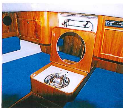
The aft cabin and its little washbasin.