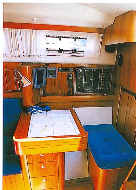
Like all the other features, the charter table deserves nothing but praise.